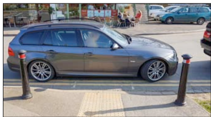
Anti-social parking – double whammy! A vehicle parked on double yellow lines and blocking the dropped kerb in Chenies Parade

Residents will be well aware of the serious parking and traffic flow problems that exist in the village. As well as a lack of parking spaces, we are experiencing increased anti-social parking.