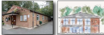
The current village hall (left). Artist's impression of the proposed new village community centre (right)

We urgently need a new community centre that will provide the sort of facilities we need now and for the future. The proposed new village community centre will have