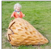
Jake and the giant strawberry!

looking for food, marking their territory, or trying to attract the attention of possible mates? Come and