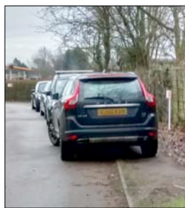
Cars parked on the footway leading to Westwood Park

Although signs are now in place, asking motorists not to block the footway in this way, some thoughtless