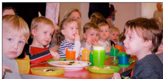
Some of the toddlers enjoying a healthy snack at the toddlers' group in the village hall

We have a wide range of toys and equipment, including ride-ons and cars, train table, kitchen area, toy cars, farm toys, see-saw, slide, dolls and pushchairs, along with a host of other play houses and