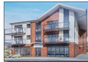
Artist's impression of the completed Chenies Parade development

The development will consist of 18 flats in one block. Six of the flats – four two-bedroom flats and two one-